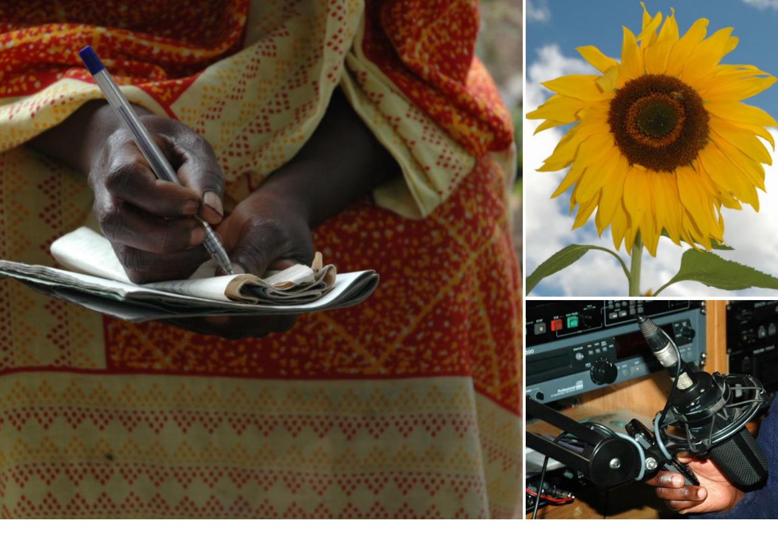
Code of Ethics