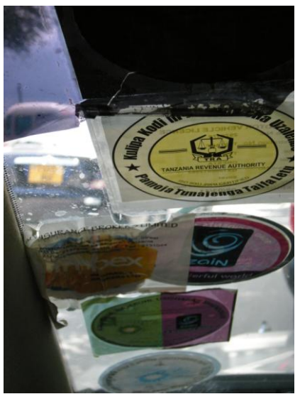
Figure 14: Mandatory vehicle stickers

TALA licenses should be processed regionally to ease the financial and administrative burdens for businesses located far from Dar es Salaam, the only place where the licenses are currently processed. For example, co-locating a TALA office in local government offices in several regions (for example, an eastern office in Dar es Salaam, a northern office in Arusha, an office in Mwanza for the Lake region, a western office in Tabora, and southern offices in Mbeya or Iringa) would significantly reduce the administrative burdens associated with obtaining licenses for many businesses throughout the sector.